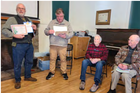
SJI Grange #966 is commended for having the most members of any grange in the state